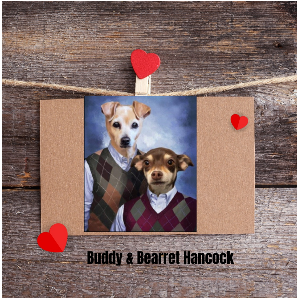
Buddy and Bearret Hancock

Buddy was born March 8, 2008 and will be turning 15 this year! He is hearing and sight impaired and he gets around much slower than in the past. He still has a lot of life left in him and is an absolute joy. He is the sweetest, most patient dog and a great older brother to Bearret. Buddy was adopted from a co-worker that had 11 dogs and one of his dogs got 3 of his dogs pregnant, leaving that family with 21 dogs. I was more than happy to take one of his puppies off their hands. Bearret was adopted from Campus for Compassion a few years after Buddy was adopted. Bearret can be found basking in the sun or burrowed under anyone's bed sheets. He is always super excited about eating by whining and barking, however, he usually does not finish his meal. No problem there as Buddy will always come by and clean up his bowl for him. Bearret is a great camping and fishing dog as he travels very well in a car. Buddy and Bearret are the best "Step Brothers" EVER.